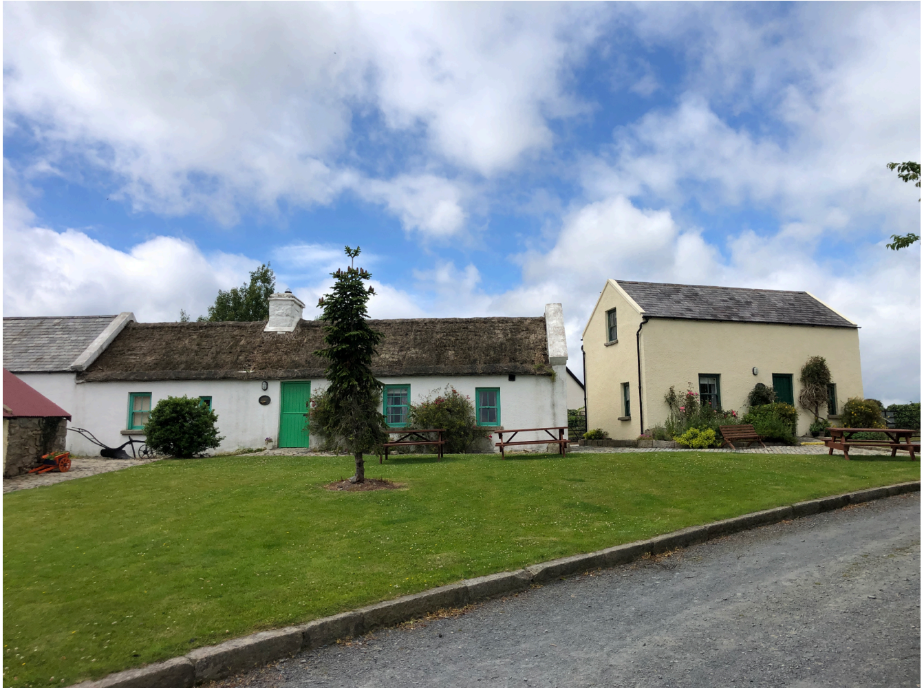
Hanna's Close Kilkeel, northern Ireland